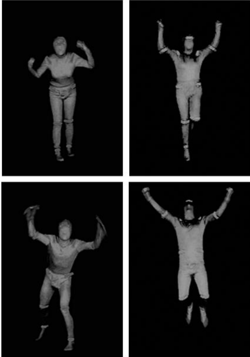
Figure 8.1. Examples of still frames taken from a female pair (top row) and a male pair (bottom row) used as stimuli in Experiments 2A and 2B. Infants viewed one of four angry-happy body pairs; in the above pairs, angry body movements appear on the left and happy body movements are on the right.